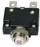
490-CBT-20A Circuit Breaker, Thermal, 20A