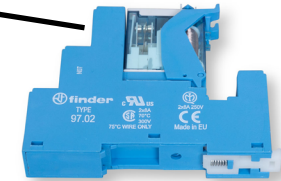
490-IMDPDT Interface Module, DPDT 8A, 24V DC, coil, LED, diode & polarity protection diode, screw terminal socket, available in AC and DC (confirm if your controller needs AC or DC)