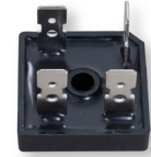
490-RECTIFIER Diode - Rectifier Bridge 400V 25A D-34A