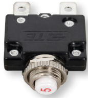
490-CBT-5A Circuit Breaker, Thermal, 5A