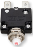
490-CBT-20A Circuit Breaker, Thermal, 20A

Cube Relay, 24 VDC coil voltage, SPDT, 15A contact rating, 5-pin, LED indicator