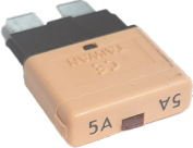
490-CBLP5A 5 Amp Manual Reset Circuit Breaker