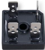
490-REC-50A Diode - Rectifier Bridge 400V 50A